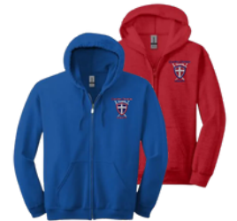
Full Zip Jacket

To purchase any uniform item please visit www.cca-nc.com/shop