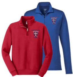
Quarter Zip Pullover

Every student must own a CCA jacket. Please ensure that your child's name is labeled on the interior tag.