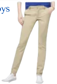
Khaki Pants (Sold Elsewhere)